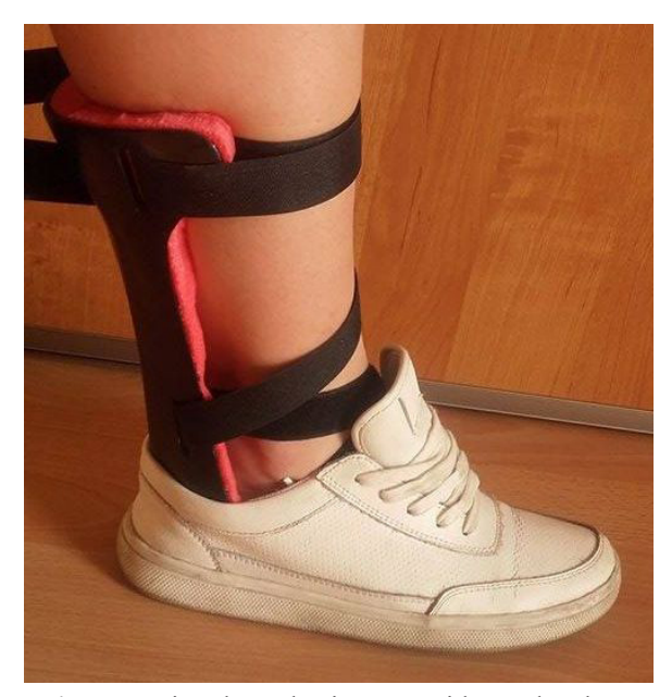
Fig. 5. Testing the orthosis – use with regular shoes

Because of a limited print volume of the Maker-Bot Replicator 2X device (selected for manufacturing of the orthosis), the model was divided into three parts in a way enabling its easy and durable connection by gluing – a shape-based connection system was planned consisting in complementary overlays, for proper mutual positioning and area for glue deposition. Each part was manufactured out of ABS material, with layer thickness of 0,2 mm and 90% infill. High Impact Polystyrene (HIPS) material was used as a support material. Total time of manufacturing of all the elements was approximately 16 hours.