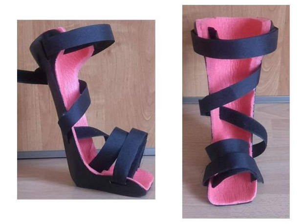
Fig. 4. Final prototype of the orthosis

In the next stages, the solid model was adjusted and corrected. Slots were added for appropriate mounting on patient's leg. The final design is presented in Fig. 3.