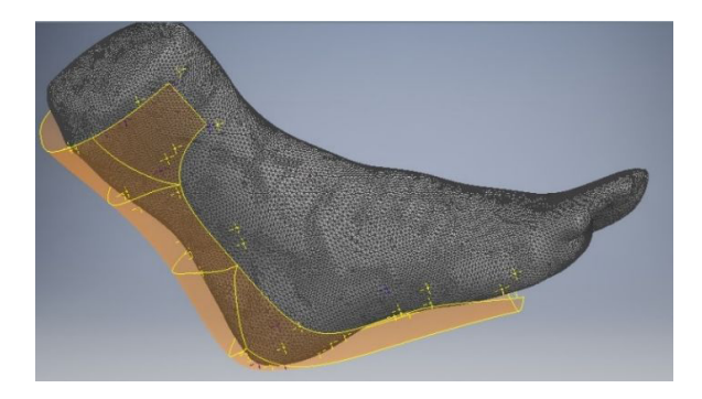
Fig. 2. Three-dimensional scan of patient's foot and freeform surface of the orthosis in the initial design stages

shorter time, thus accelerating the whole manufacturing process. This approach is constantly developed, to make it possible to reduce both time and costs of material [9].